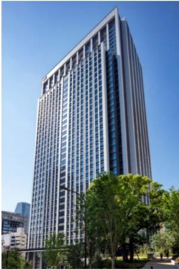
Photograph of the Property, Vicinity MAP of the Property